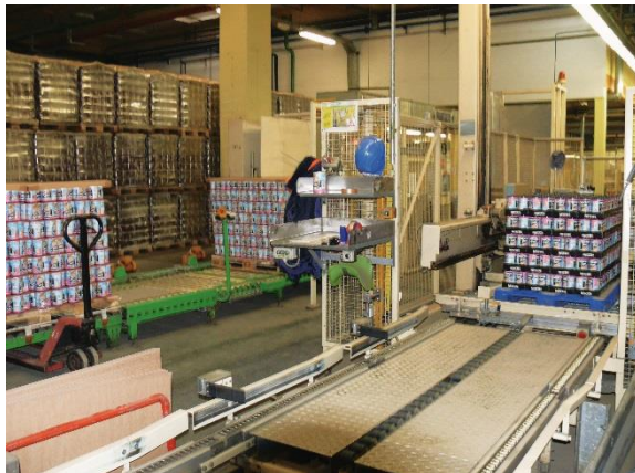
The Nestlé factory in Mainz uses fully automated production plants. Among other things, around 14,000 tonnes of Nescafé is produced here.